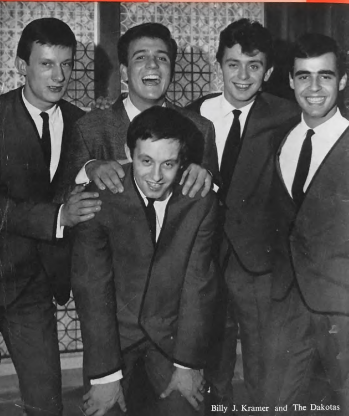
Billy J. Kramer and The Dakotas